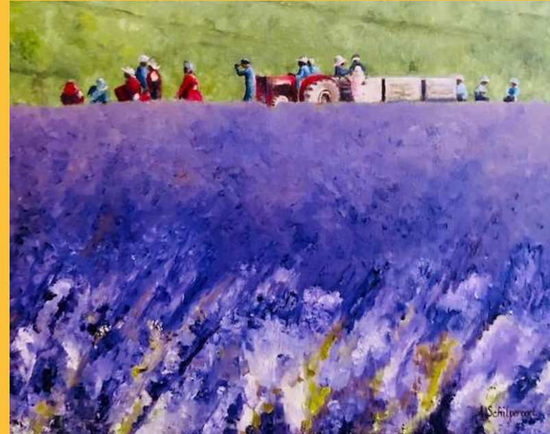
Harvest of Hope – oil on canvas