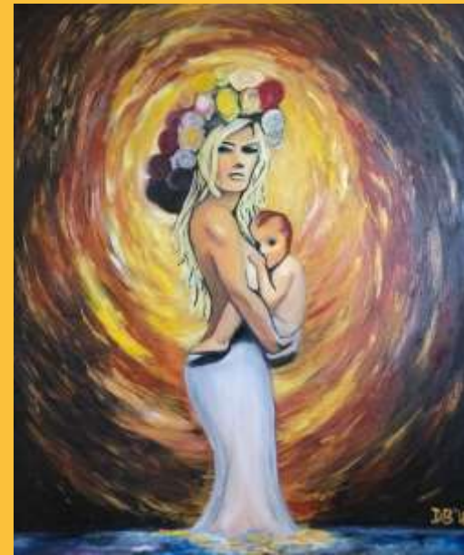
Mother Sun – oil on canvas