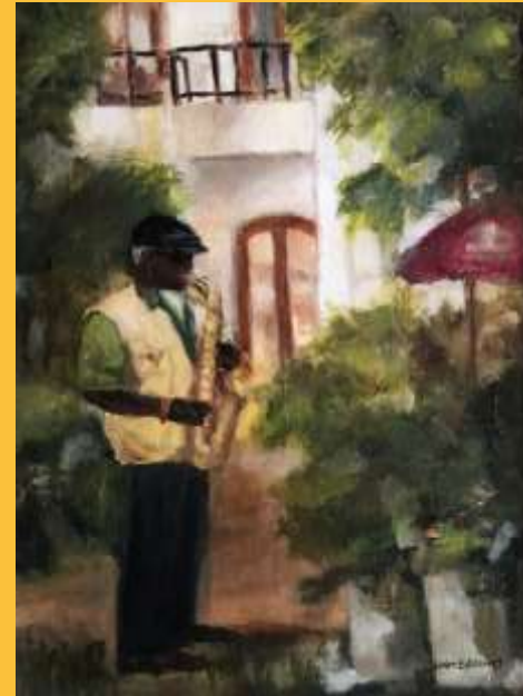
Playing from the Heart – oil on canvas