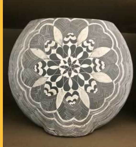
LOVE is our DNA - ceramic vases