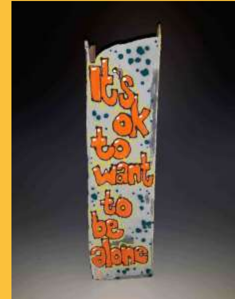
The Shacks – ceramic vases

“My ‘Shacks’ are inspired by urban graffiti and give a voice to often unsaid thoughts in my head. If people can find a way of speaking about their problems and challenges, it often starts a dialogue towards finding a solution.”