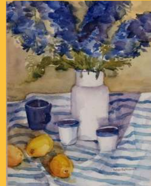
The Colour Purple – water colour