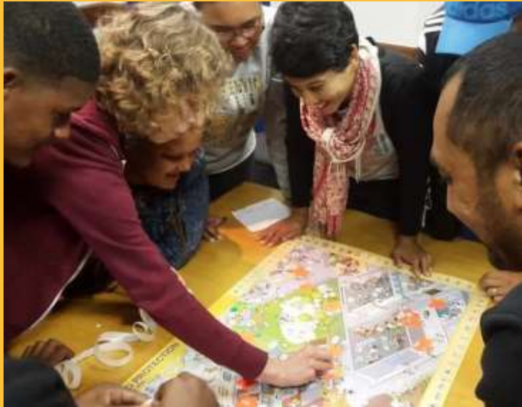
Empowering child protection organisations