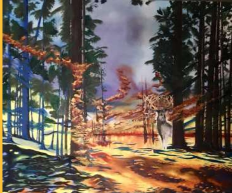
Into the Woods – oil on canvas