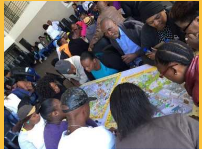
Engaging meaningfully with communities

Courage is a picture based child protection community engagement programme and toolkit that was launched in 2015. The programme has grown from strength to strength and is now being used in a number of countries around the world, in support of their child protection and community building efforts. In 2018, we are pleased to announce that Courage has been registered as a Not for Profit Company (NPC) in its own right, and we would like to recognise this during Child Protection Week 2018.