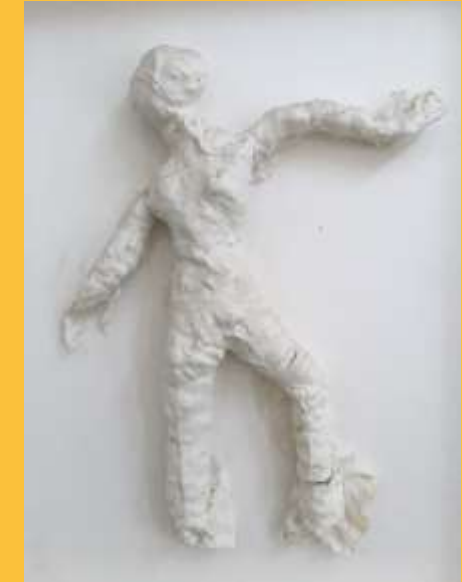
There can't be loss without the other – porcelain dolls