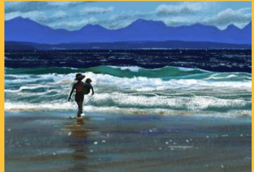
Beyond the Waves – print