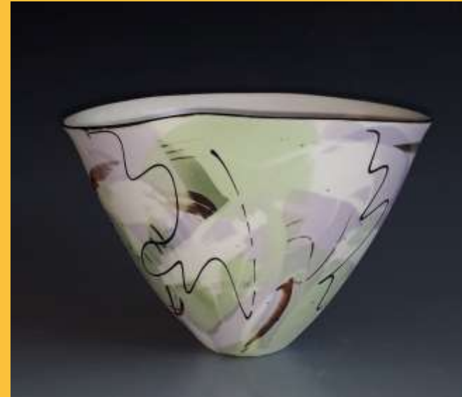
What Lies Within - bone china bowl