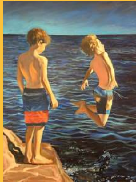
Leap of Faith – oil on canvas