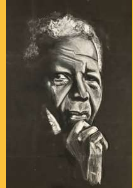
Madiba – charcoal