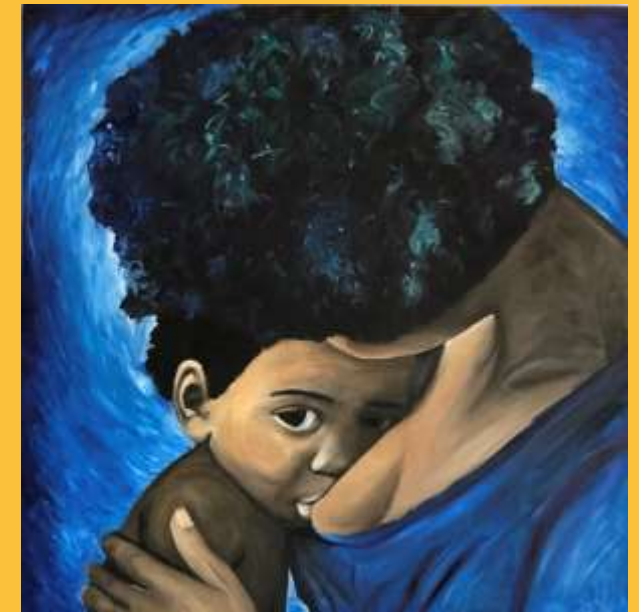
Sister Moon – oil on canvas

Her contribution to the show are two paintings depicting mother's breastfeeding their babies. "I have always thought that breastfeeding is the most beautiful expression of love and care, yet many ostracise and humiliate mothers who dare to feed their children in public. As with all my work, these paintings represent the entanglement of my two great loves, creativity and social activism."