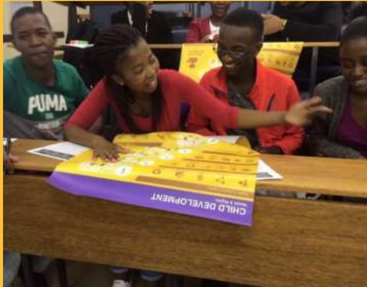
Developing practical skills in tertiary education