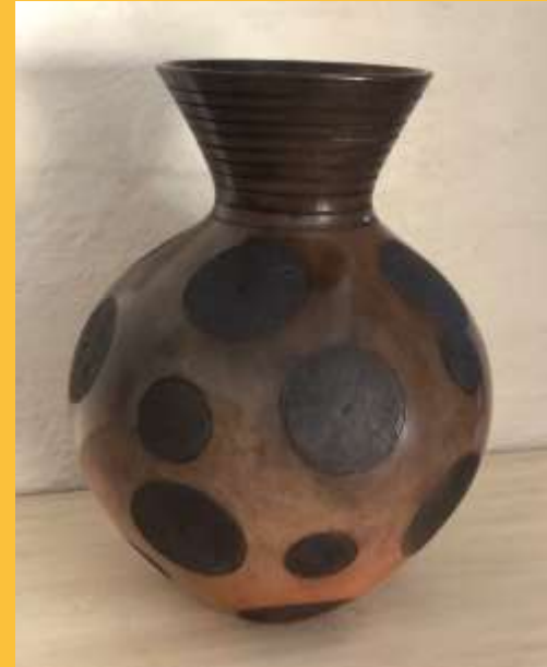
Circle of Life – terracotta pot