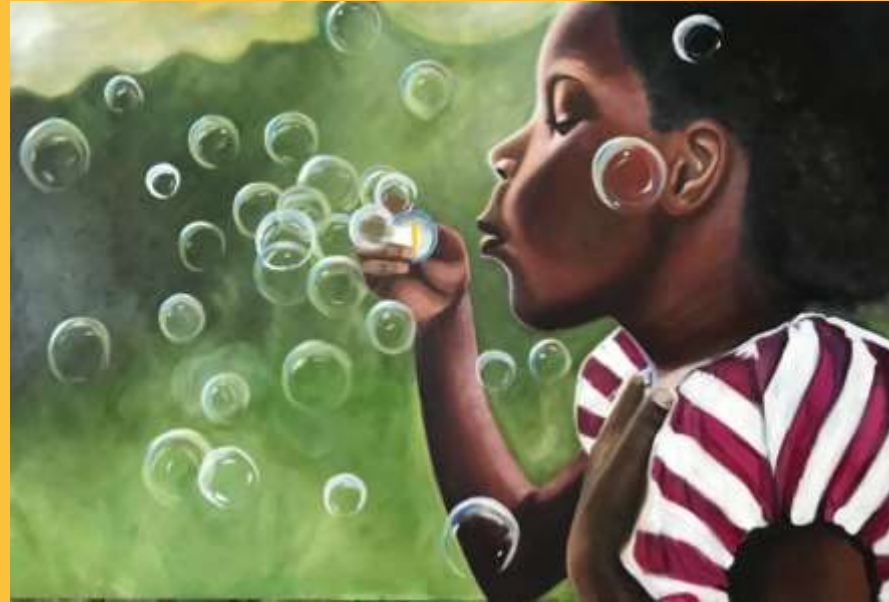
Bubble Girl – oil on canvas