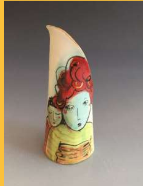
Mother and Child – porcelain vessel